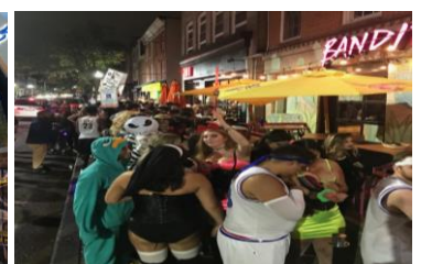
BLLC Staff photos from Halloween 2019