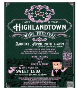
Above: Recent one-day license events including Baltimore Rock Opera Society, FlowerMart, and Highlandtown Wine Festival.