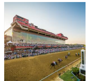
Above: Pictures from Pimlico Instagram account @pimlicorc