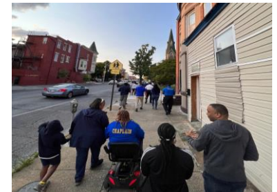
Above: Pictures from the May 18 th walk in the BPD Eastern District.