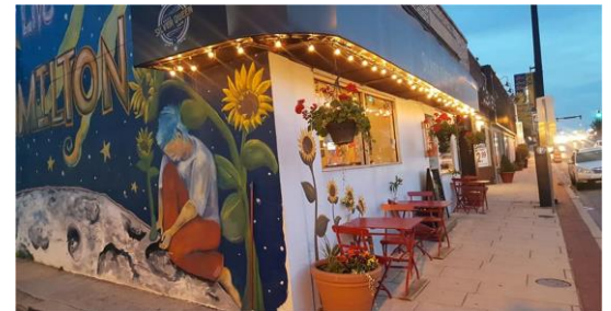
Screenshot from the 8-20-2020 BLLC virtual hearing and picture of the Silver Queen Cafe (Café Facebook Page )